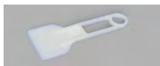
Plastic puddy knife

So, if you can't use these cleaning agents, what can you safely use? You can use a cleaner that you would use for your granite kitchen countertop. You can also contact a local headstone company to ask for their advice. Better yet, you will find many approved products online. One of the most common is D/2. But whatever brand you buy you can follow these instructions: With a hard, sharp plastic puddy knife, first scrape off the lichen or moss. If there are engravings (letters, numbers, designs), use a plastic crevice cleaning tool. A hard toothbrush also helps. You can use a stiff household cleaning brush—but not a metal-bristled one. Once you scrape off as much lichen and dirt as you can, apply the cleaner until everything is saturated. Cover with a large plastic bag. At this point you can start cleaning another stone. If you are cleaning only one, take a 15–20-minute walk around the cemetery and you may be surprised at some of the interesting history you can find. When you return, remove the bag and scrape off the dirt and lichen with your plastic tools and brushes. Rinse with plenty of water. If you still notice residual dirt and lichen repeat the process.