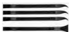
Plastic crevice cleaning tool

You can now stand back and admire how beautiful the stones look. No one may ever notice but YOU will know. Now you can see why in Hebrew there is an actual phrase for headstone cleaning. It really is a true loving kindness.